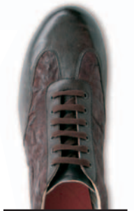
Testa di Moro